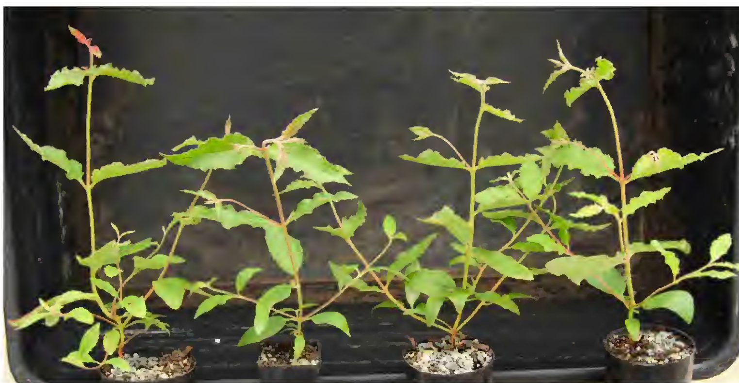
Fig. 4. Four seedlings (from many grown) of Eucalyptus expressa , ex Melon Creek, Yengo National Park (Nicolle 5266 & Bell).

Seedlings have been grown from the Putty Road and Melon Creek populations of E. expressa (Fig. 4). The seedling morphology within and between these populations is consistent, providing further evidence that the new species is not of recent hybrid origin. In general, the seedlings are morphologically similar to E. eugenioides .